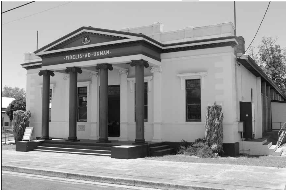
Baradine Memorial Hall